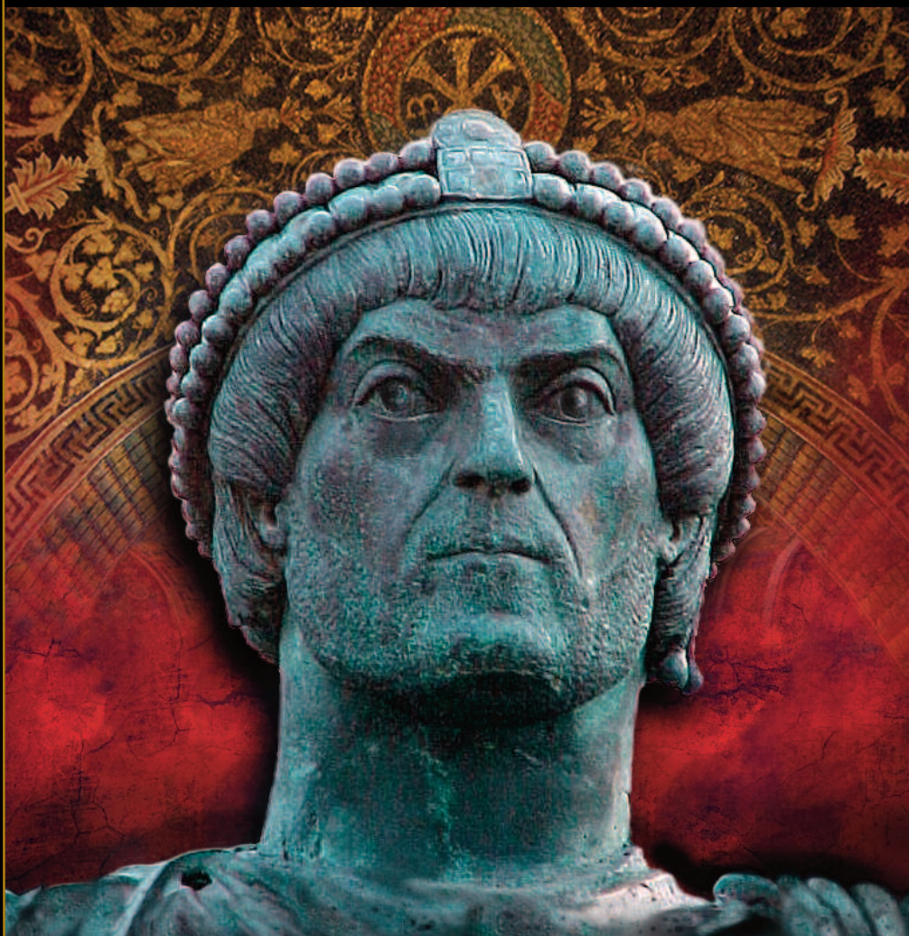
Colossus of Barletta, depicting an emperor of the Late Roman Empire.