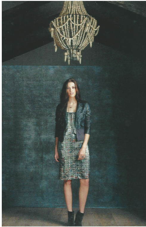
A chic photo shot for my Babakul look book.