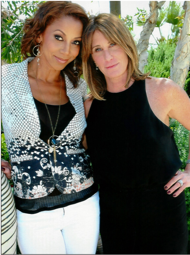
My true BFF. Holly Robinson Peete, me