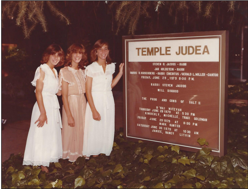
Bat mitzvah in triplicate.