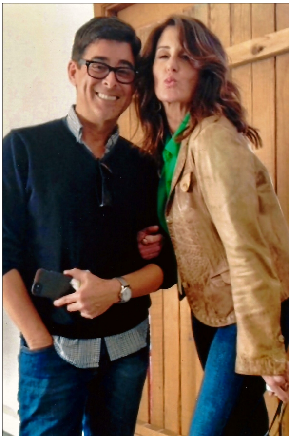
A good partnership. DJ, me