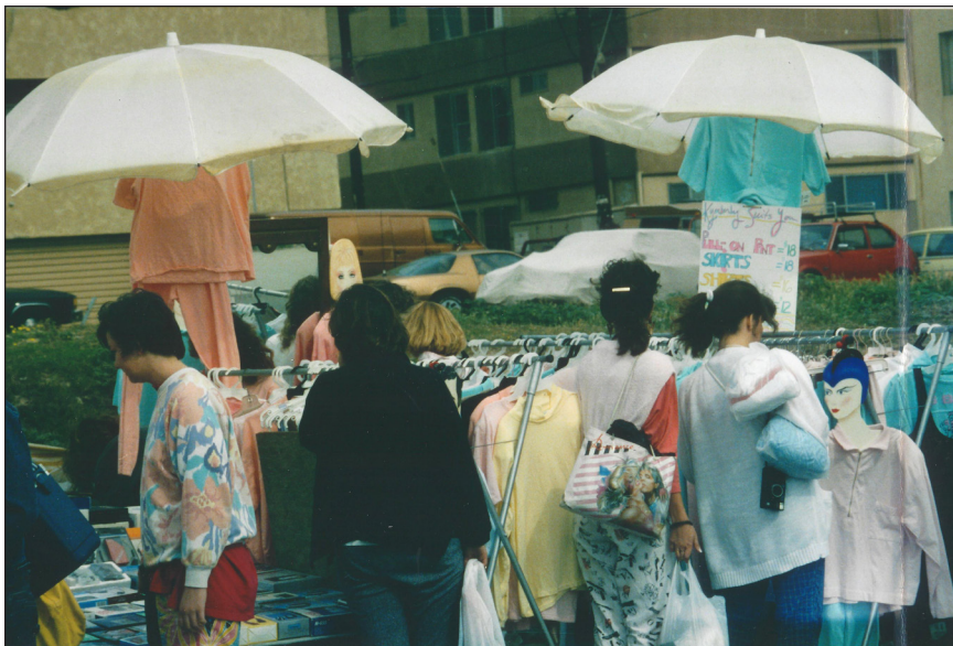
Selling clothes in Venice back in the day.