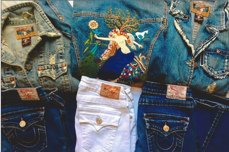
Some of my original designs for True Religion.