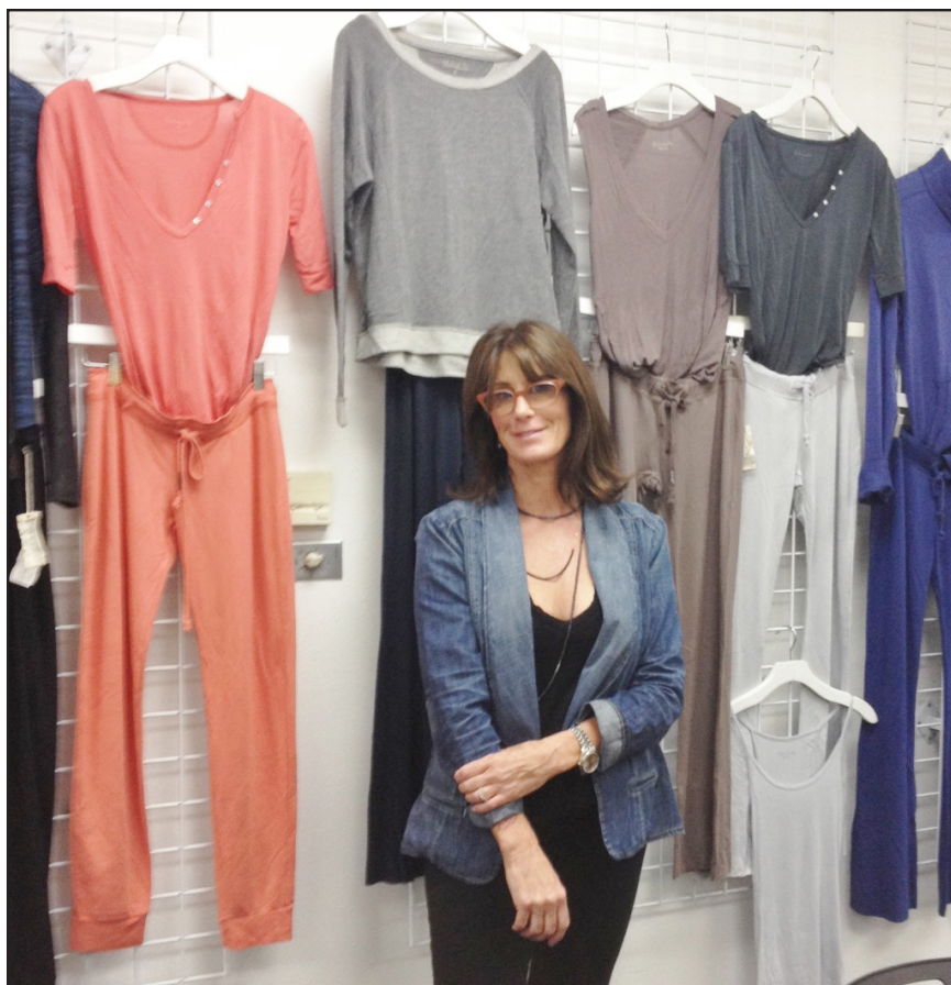
The designer at work.