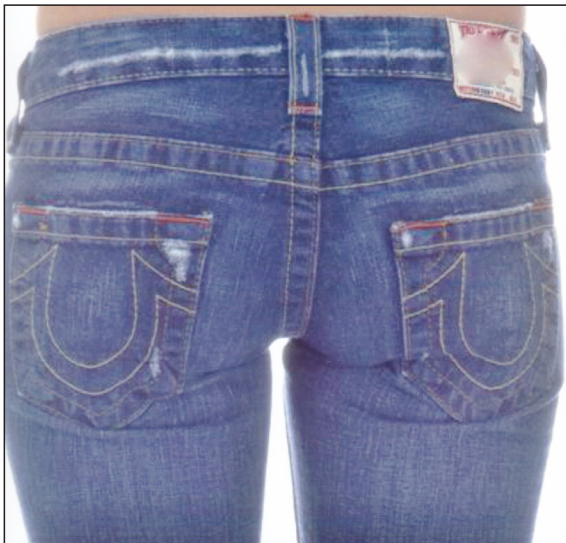
The original Joey jeans.