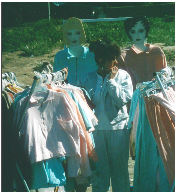
Selling in Venice, so much to do, so little time.