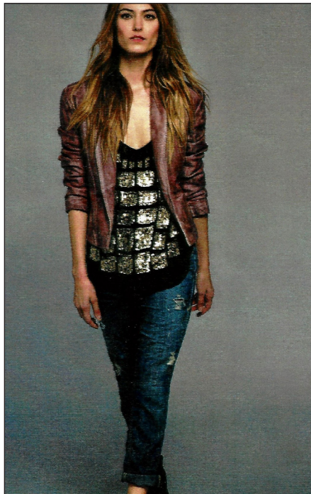
My design idea for a Holiday collection.