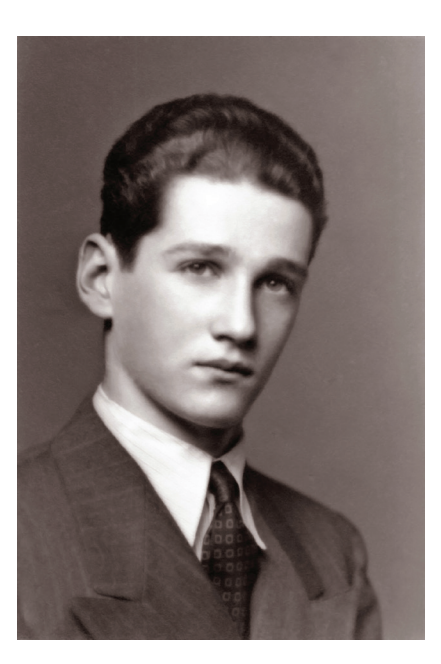
Me as a young boy.