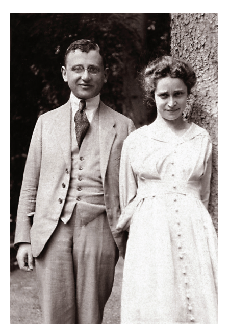
My parents on their wedding day.