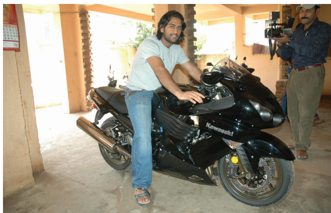
One among many: Always passionate about bikes, he flaunts one of the several he owns