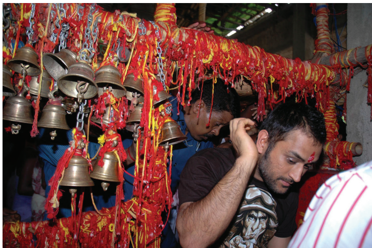
He plays, he prays: At the Deori Mata temple in Ranchi