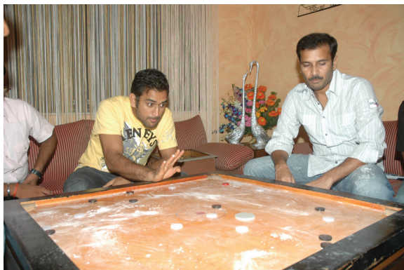
Perfect all-rounder: He still cannot resist playing carrom, an indoor sport he is very good at