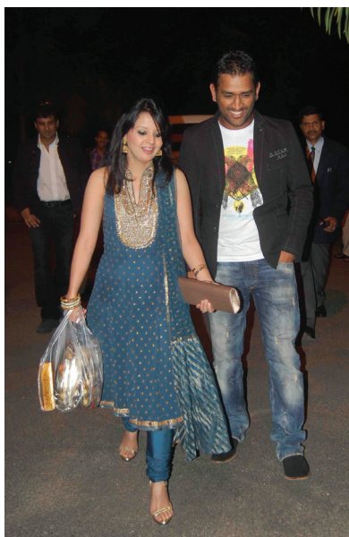
Jharkhand's most wanted: The newly married Dhonis attend a party hosted by the Chief Minister of the state