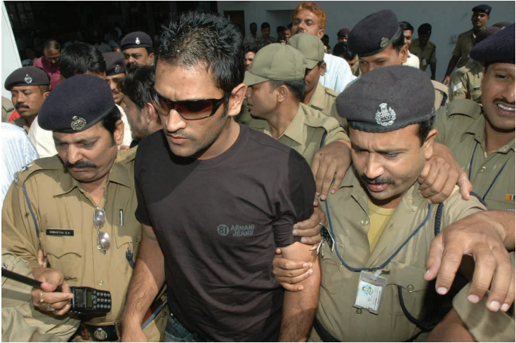
Security first: Escorted by the cops after his arrival at the Birsa Munda Airport in Ranchi