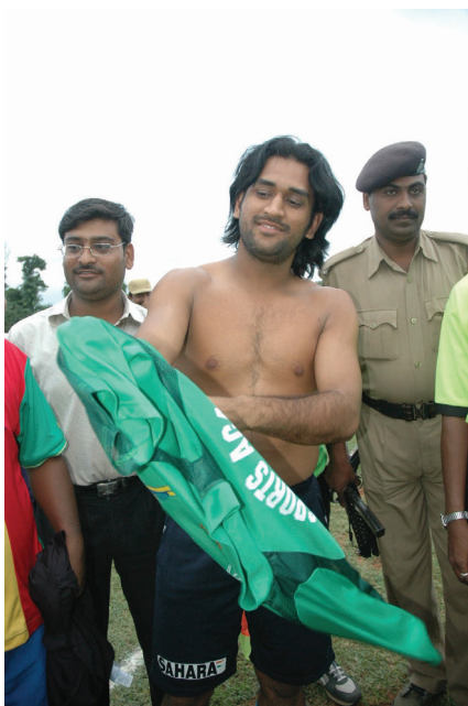
Different ball game: He gets ready for a football match at Silli near Ranchi