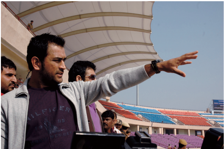
Look at that!: Dhoni offers a picture perfect moment during his inspection of the Mega Sports Complex in Ranchi