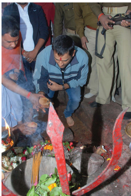
Reaching out for God: He offers his prayers to the Almighty