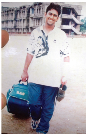
Winning single-handedly: Playing with a fractured hand, he pulled off a victory for his team