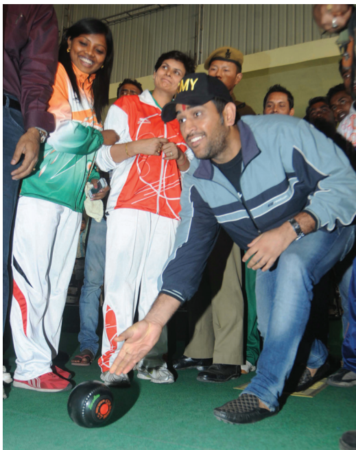
Bowling on a different pitch: Trying his hand at bowling at the R K Anand Lawn Bowls Stadium in Ranchi