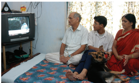
Rising son: Sitting inside their old MECON Colony home, his parents watch their son with bated breath