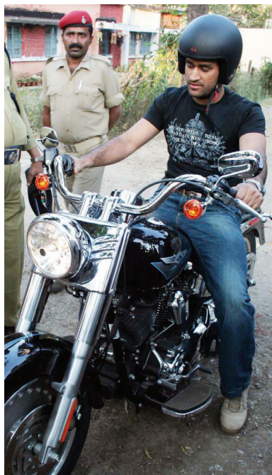
Dreams come true: The Indian skipper on his Harley Davidson in his hometown