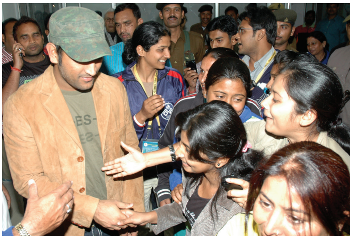
At home with games: During the 34th National Games at the Mega Sports Complex in Ranchi