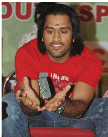
Catching practice: About to catch the cell phone of one of his fans who had requested for an autograph on it during a local tournament in Ranchi