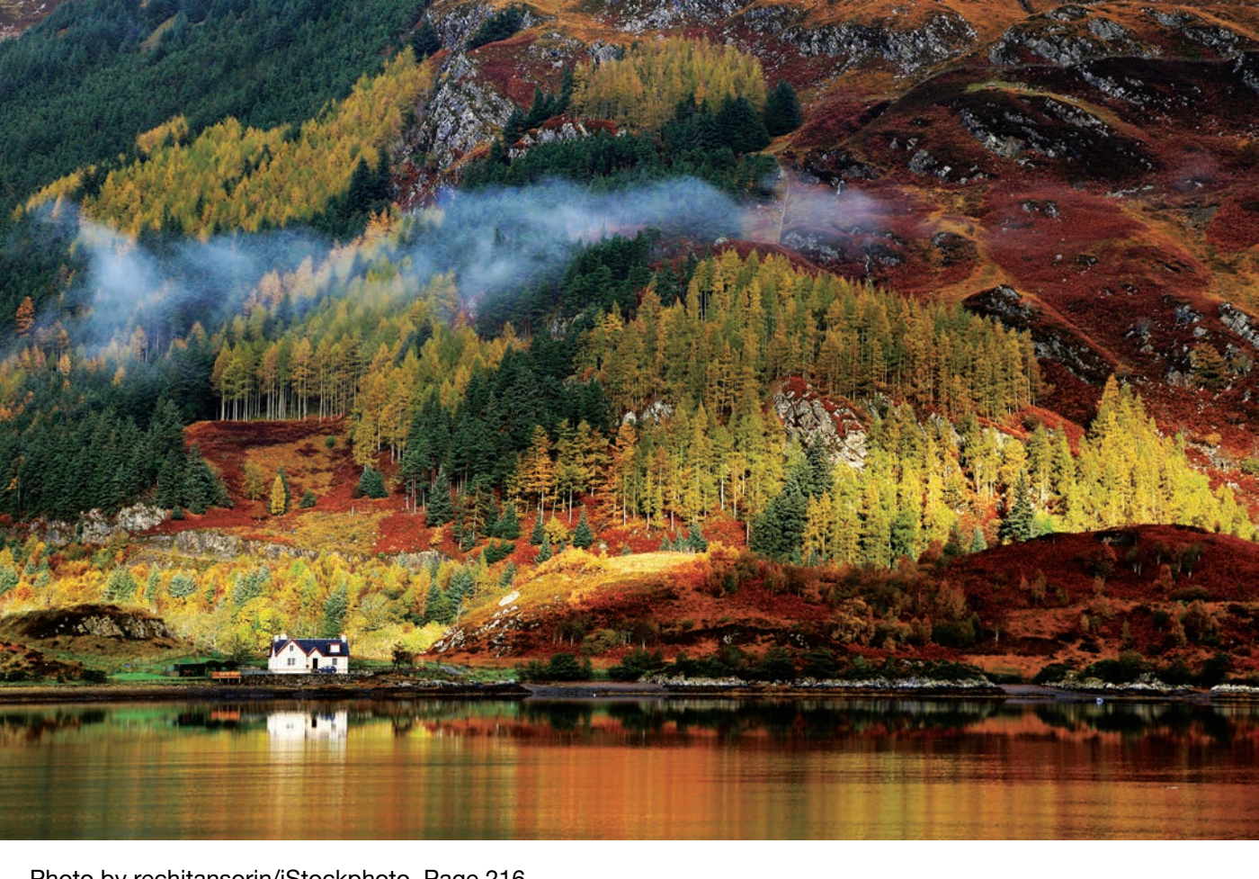
Page 216 Author Andrew Evans finds a "haunting and heavy beauty" in the bloody history-steeped Glencoe mountains in Scotland.