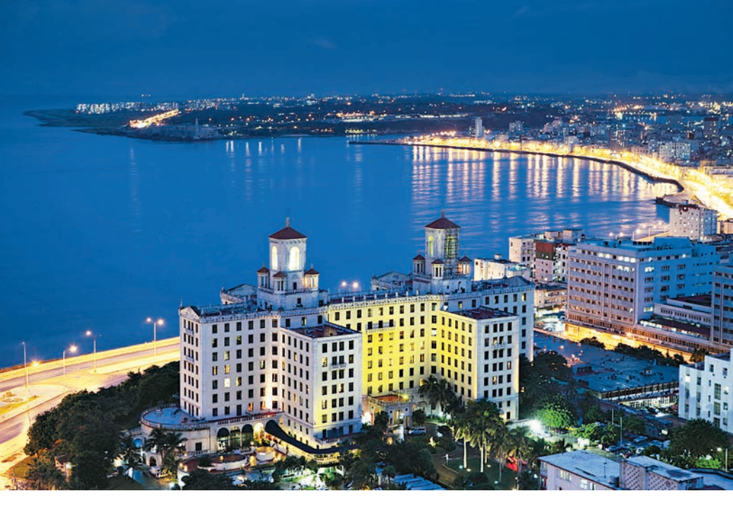
Page 95 Havana's Hotel Nacional conjures treasured times in Cuba.