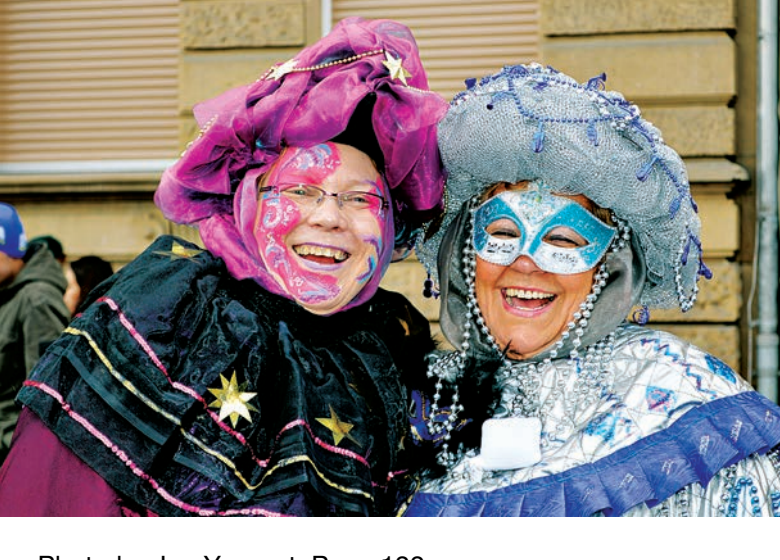
Page 122 Fasnacht, the carnival before Lent, in Germany.