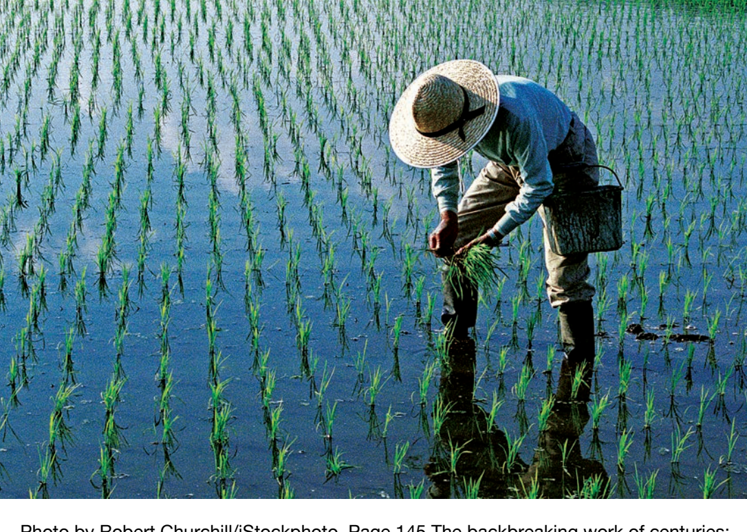
Page 145 The backbreaking work of centuries: a rice field worker in Wakayama, Japan.