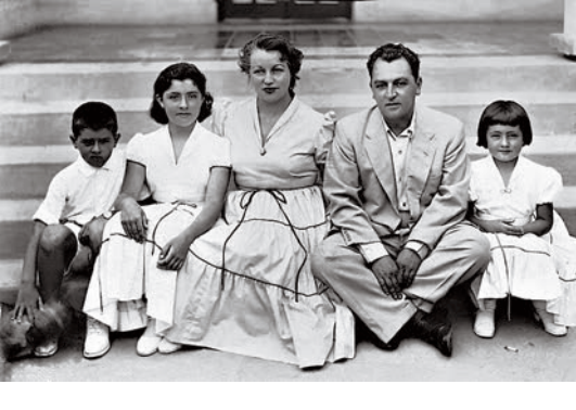
The author (far right) and her family on the front stoop of their old Cartavio home in Peru.