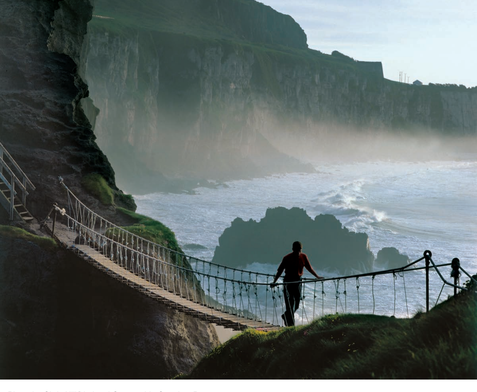
Pages 244-245 A precarious and misty perch along Northern Ireland's windswept North Antrim coast.