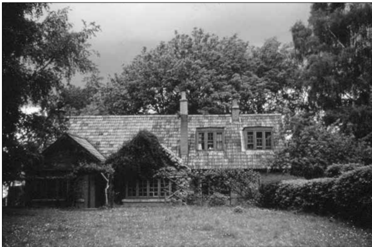
The Kilns, Lewis's home in Headington Quarry, Oxford, June 1958