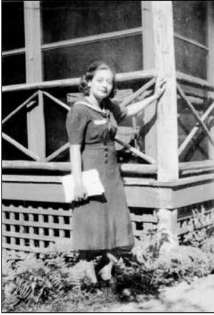
Joy Davidman at the MacDowell Colony, Summer 1938