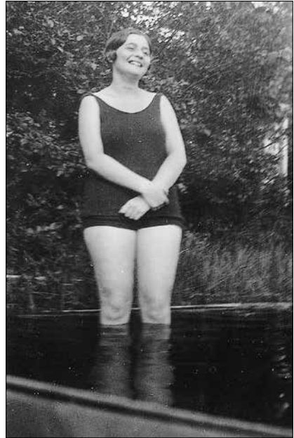
The Catskills were a favorite vacation destination for New York City's Jewish families, including the Davidmans. Here, Joy stands in Lake Florence, in Roscoe, New York, in August 1931, shortly before starting her sophomore year at Hunter College.