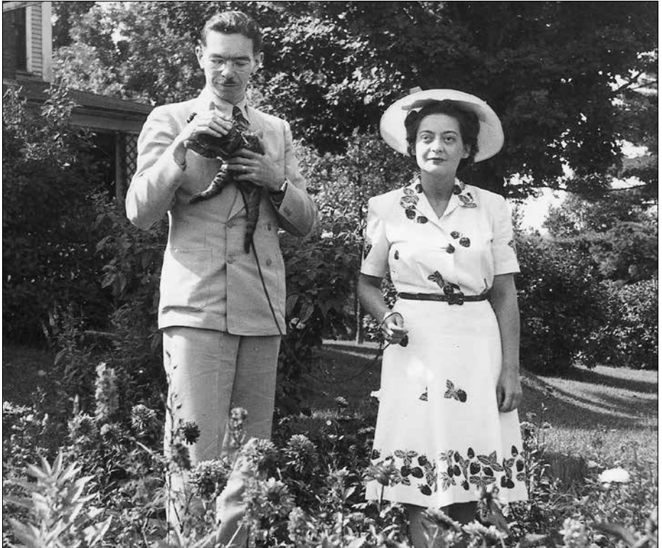
Joy and Bill Gresham on their wedding day at the MacDowell Colony. Joy is holding a leash for the cat in Bill's arms. August 24, 1942.