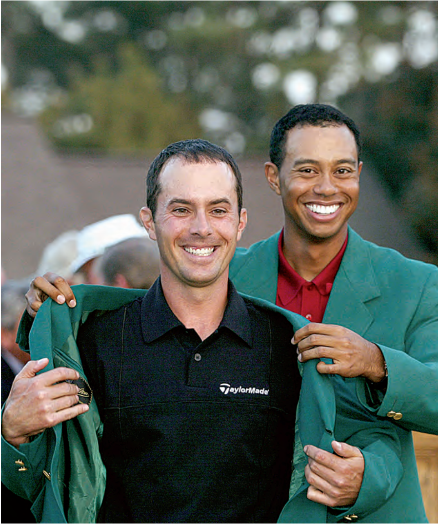
Mike Weir's finest hour: receiving the green jacket on the Augusta National putting green from Tiger Woods.