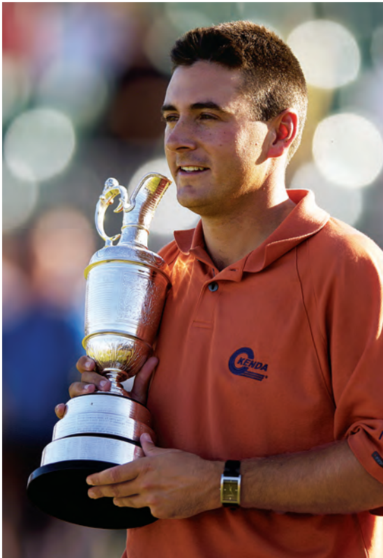
Ben Curtis with the Claret Jug, the trophy that put him in the same sentence with Francis Ouimet.