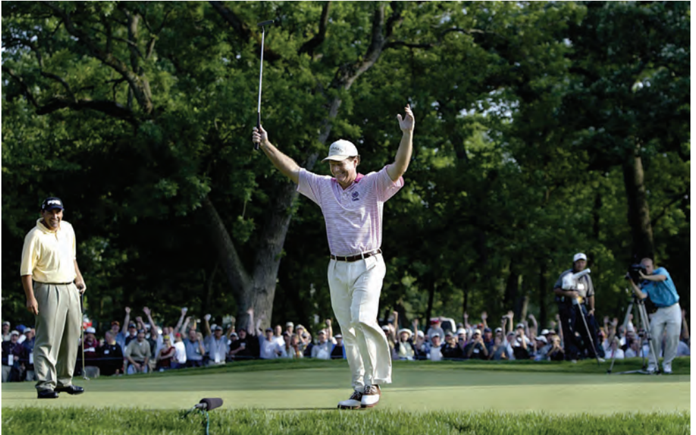
For one day, the 2003 U.S. Open belonged to Tom Watson and his caddy, Bruce Edwards.