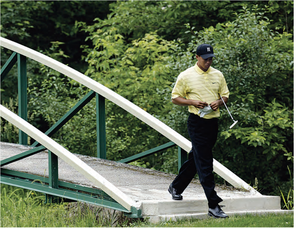
Tiger Woods sought a new swing in 2003. It wasn't until 2005 that he again crossed the bridge to dominance.