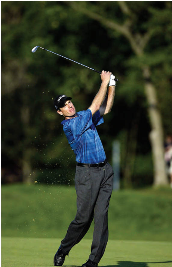
Jim Furyk's unorthodox swing has produced remarkable results through the years.