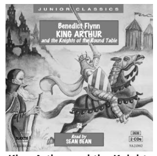
King Arthur and the Knights of the Round Table (Flynn) 2CD/2MC – NA213812/4