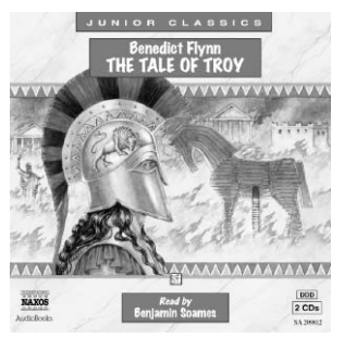
The Tale of Troy (Flynn) 2CD/2MC – NA209812/4