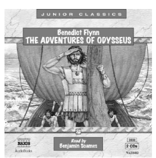
The Adventures of Odysseus (Flynn) 2CD/2MC – NA211412/4