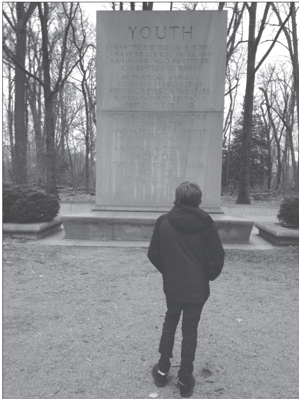
"Youth," Theodore Roosevelt Memorial, Theodore Roosevelt Island