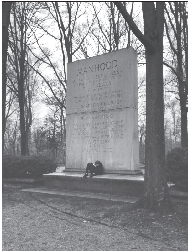
"Manhood," Theodore Roosevelt Memorial, Theodore Roosevelt Island