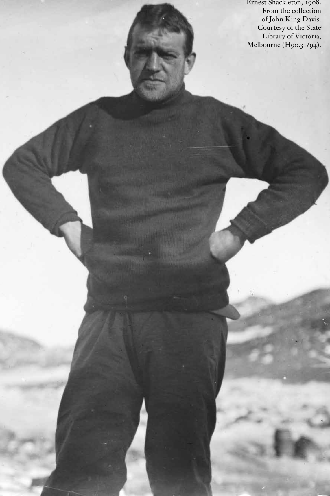
Ernest Shackleton, 1908. From the collection of John King Davis. Courtesy of the State Library of Victoria, Melbourne (H90.31/94).