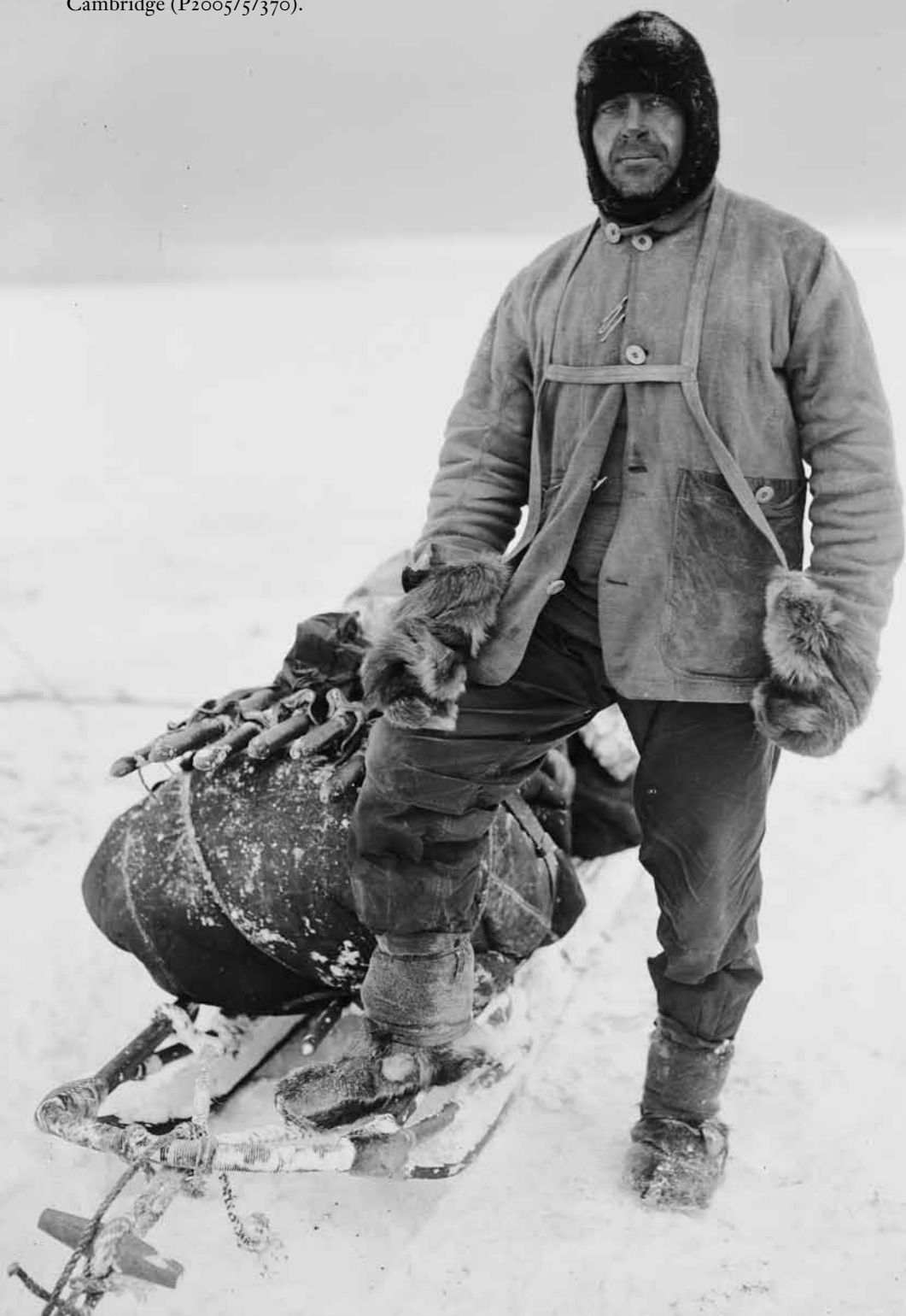
Robert Falcon Scott in Antarctica, 1911. By Herbert Ponting. Courtesy of the Scott Polar Research Institute, Cambridge (P2005/5/370).