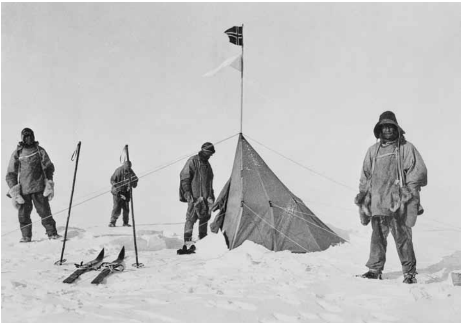
The British discover the Norwegian tent, Polheim, at the South Geographic Pole, 17 January 1912. FROM LEFT: Robert Scott, Lawrence Oates, Edward Wilson, Edgar Evans.