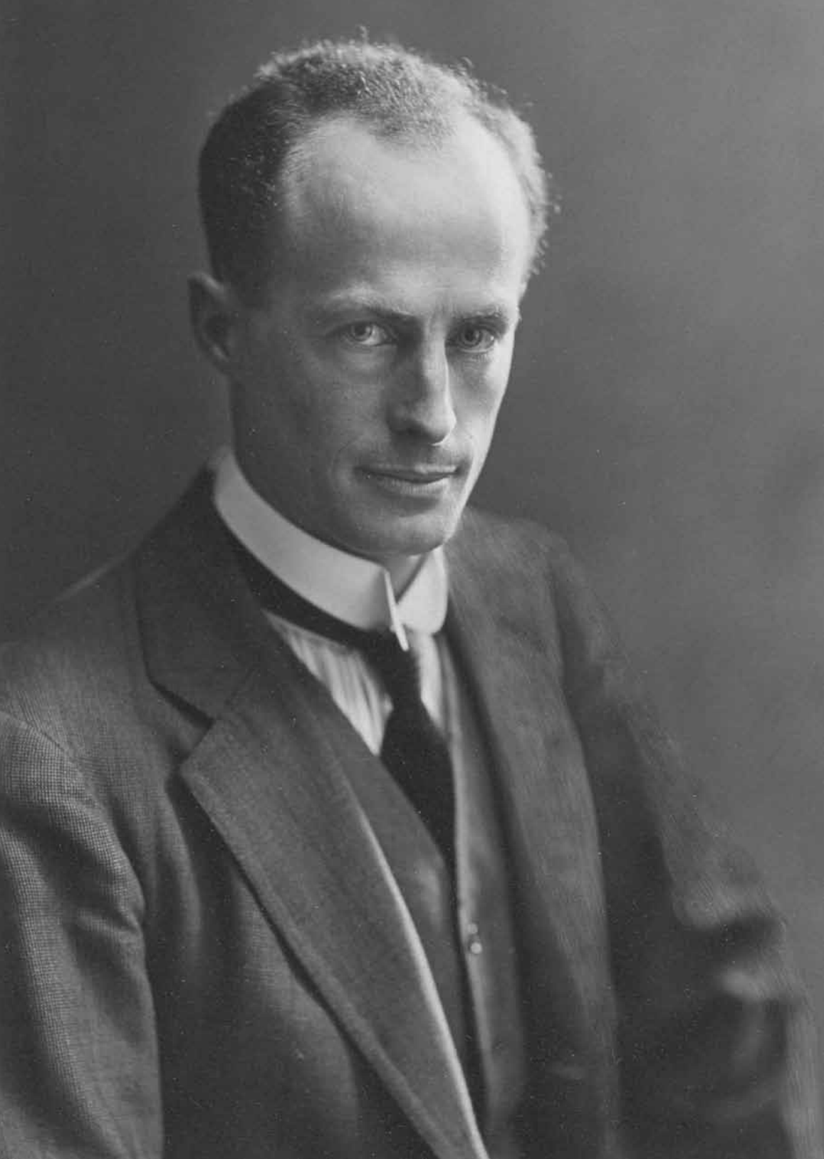
Douglas Mawson, c. 1916.