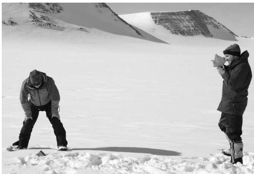
In honour of the Norwegian Antarctic Expedition: taking a sextant observation in the Ellsworth Mountains, 2012.