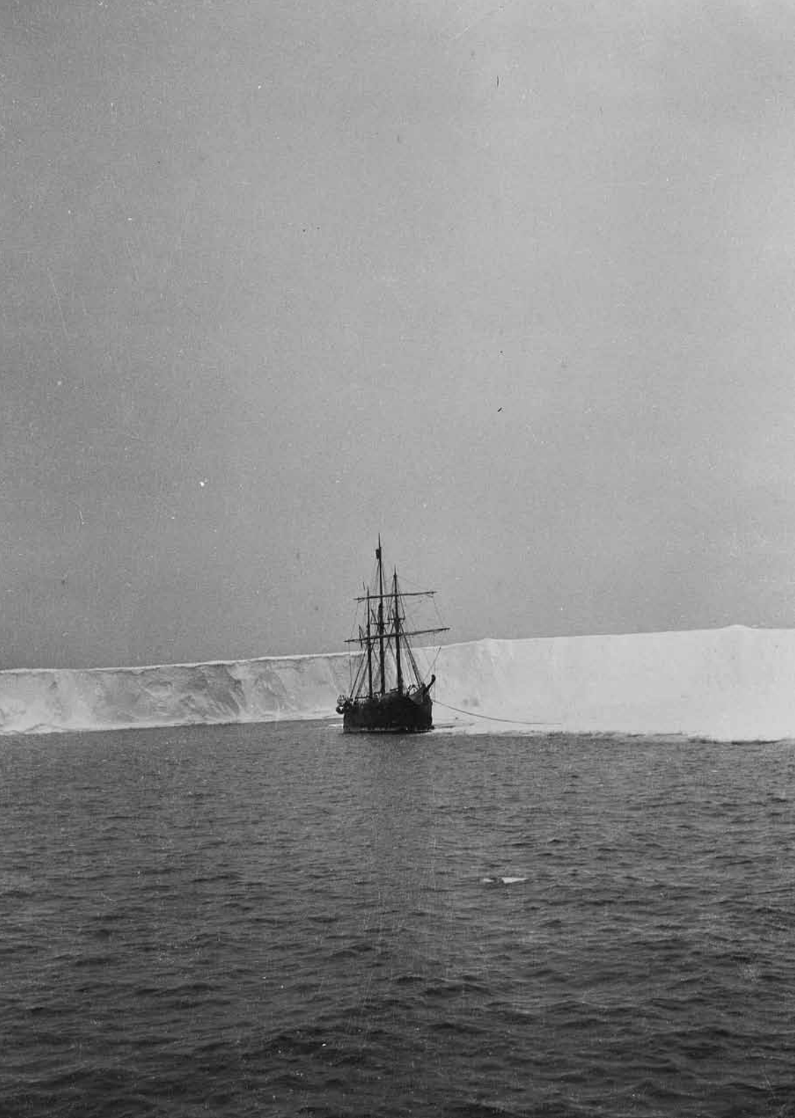
The Norwegian expedition vessel Fram in the Bay of Whales, 1911. By Frank Debenham. Courtesy of the Scott Polar Research Institute (P54/16/539).