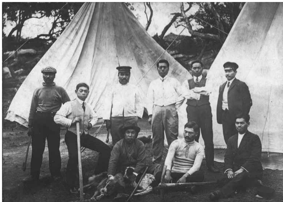
ABOVE: The Japanese Antarctic Expedition in Sydney, Australia, 1912. Nobu Shirase is seated at left, with dogs.