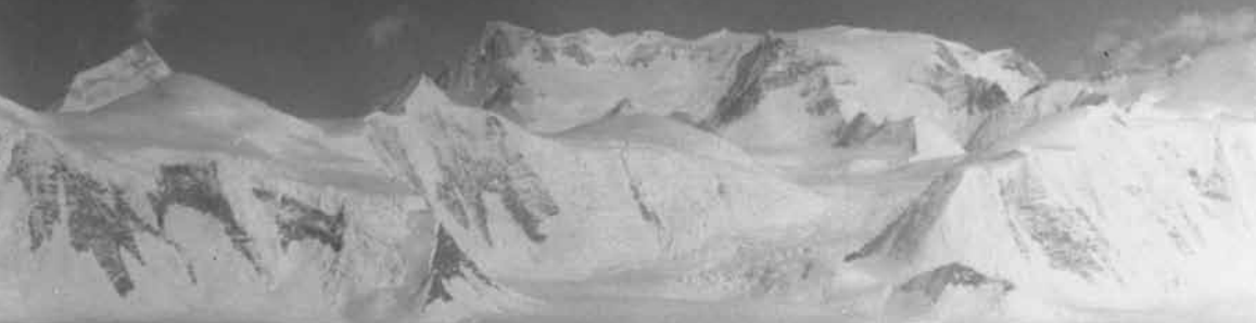
Mount Vinson, in the Sentinel Range of the Ellsworth Mountains, 2011.