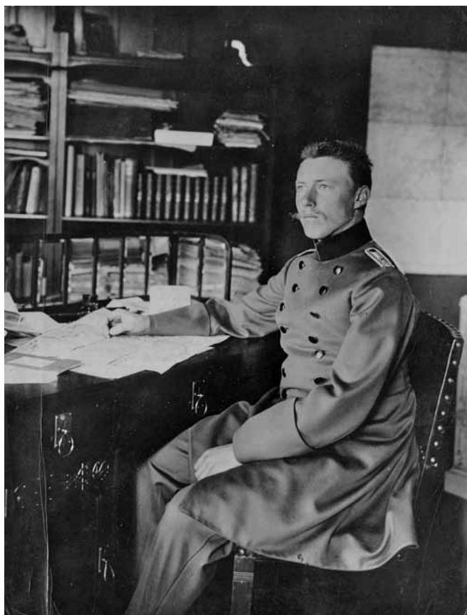
RIGHT: Wilhelm Filchner, 1906.