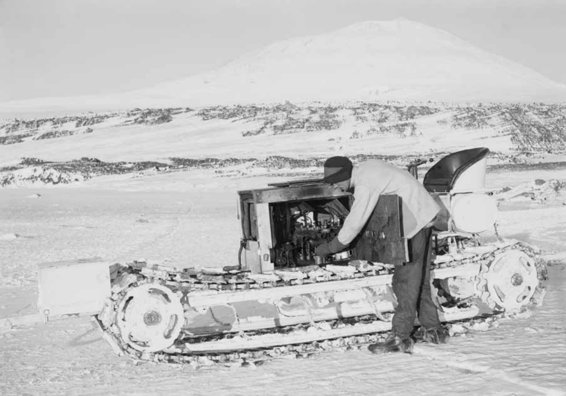
Servicing one of the British motorised sledges in front of Mount Erebus, 1911. By Herbert Ponting. Courtesy of the Scott Polar Research Institute (p2005/5/568).