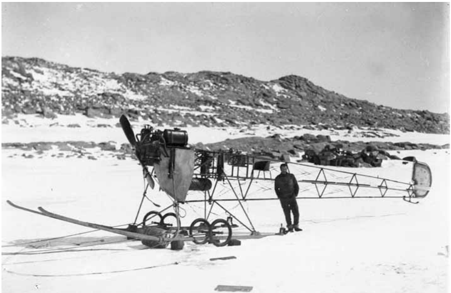
The Australasian air tractor at Cape Denison, 1912. By Frank Hurley. Courtesy of the Mitchell Library, State Library of New South Wales (36464).