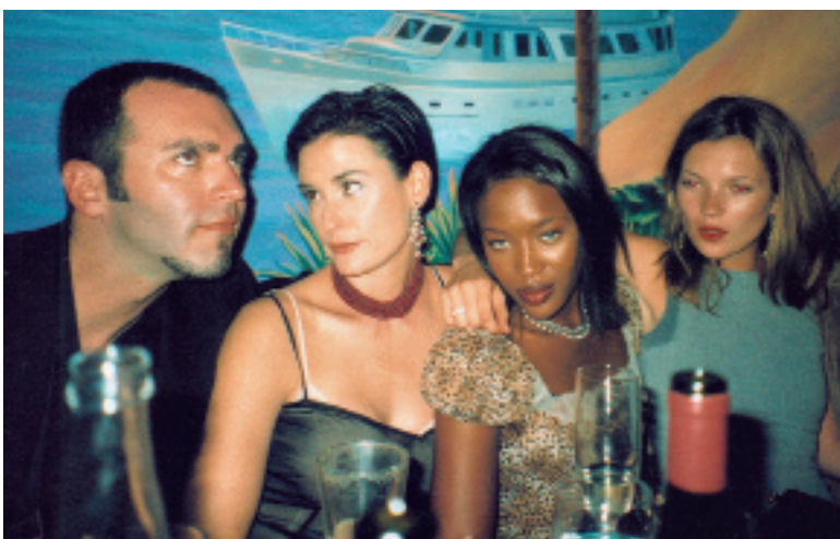
The Planet Hollywood opening in Cannes in May, 1997—me, Demi, Naomi, and Kate.