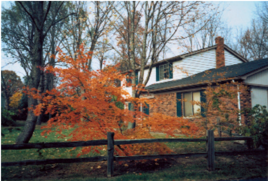
Our house on Oklahoma Avenue.