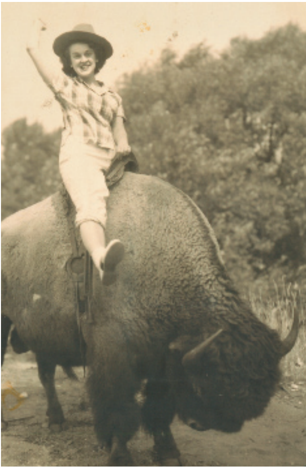
My mother in her prime, riding a buffalo, 1951.