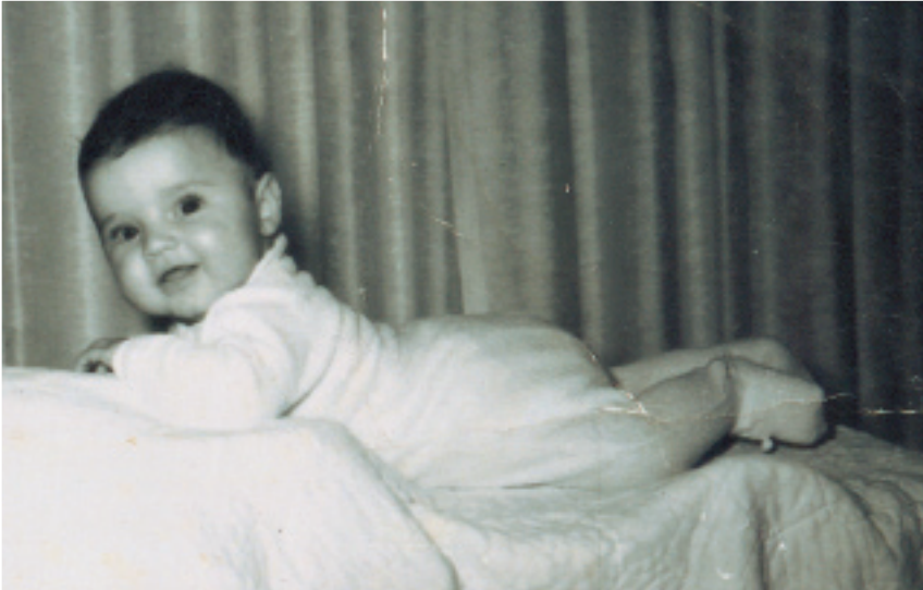
Me showing off my assets, April, 1961.