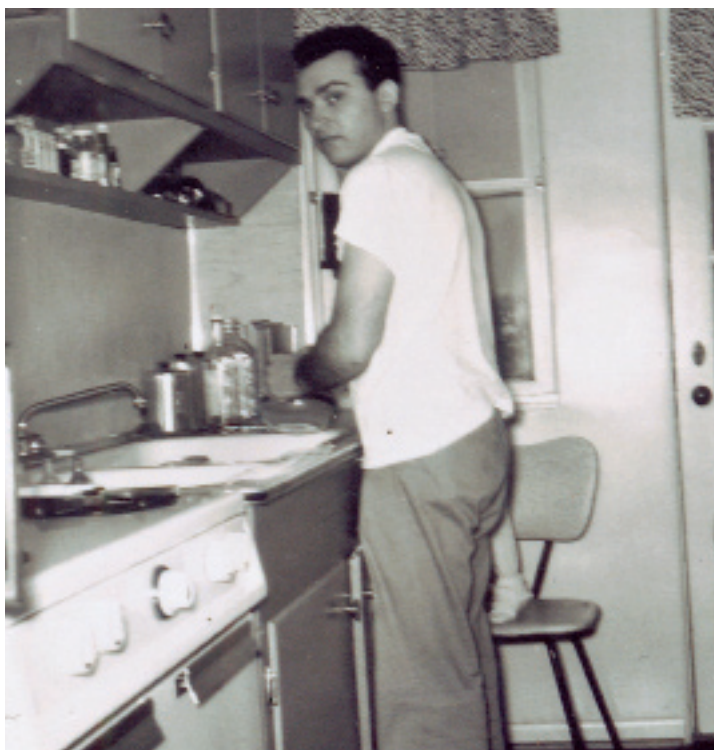
My father in the kitchen, looking young and handsome, April, 1958.