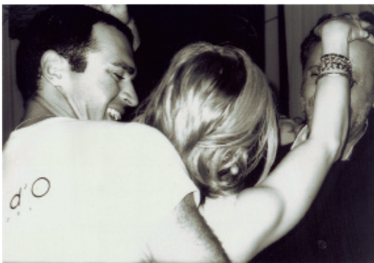
Same event, with Gianni Versace.