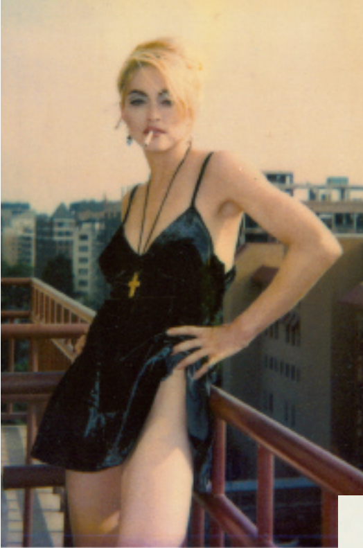
Madonna, the day before the Dick Tracy premiere, 1990.