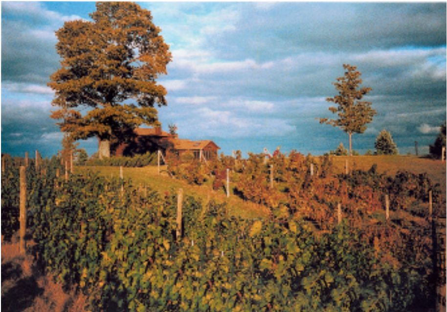
Ciccone Vineyard and Winery in Traverse City, Michigan, 2003.