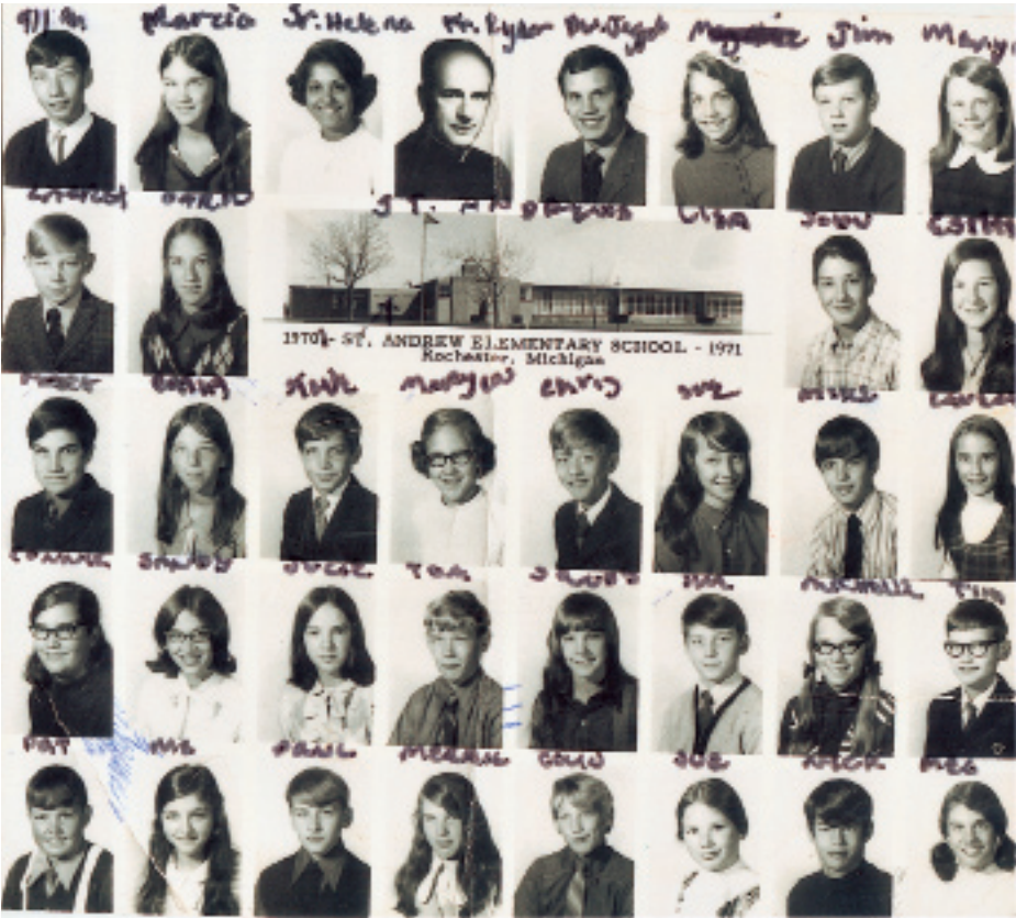
Madonna's elementary school class picture.