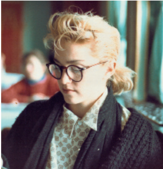
Madonna in a Shanghai restaurant, prior to the shooting of Shanghai Surprise, which premiered in August, 1986.