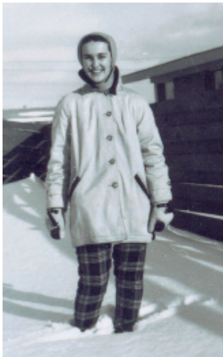
My mother in the backyard, just before she was diagnosed with cancer, February, 1964.