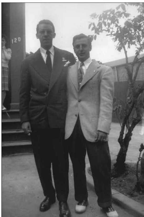
Tony with drummer Buddy Rich outside of Tony's New Haven, Connecticut, home. Buddy Rich was a member of Tommy Dorsey's band, and Frank helped him get out of his contract with Dorsey.