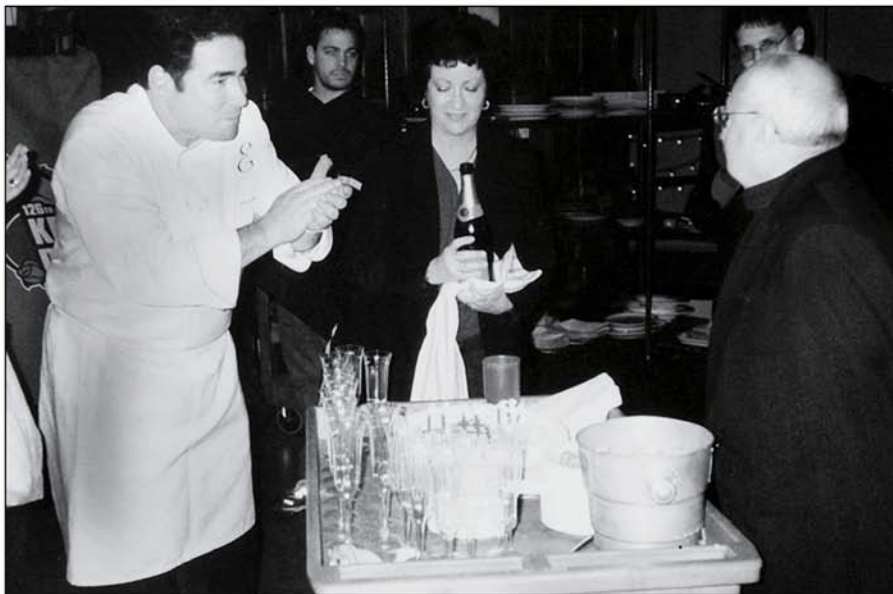
Backstage at a taping of Emeril Live , where Emeril Lagasse presented Tony with a birthday cake.

Whenever Frank performed at Foxwoods Casino in Connecticut, the casino would commemorate the event by issuing special gambling chips with Sinatra's portrait and famed signature.