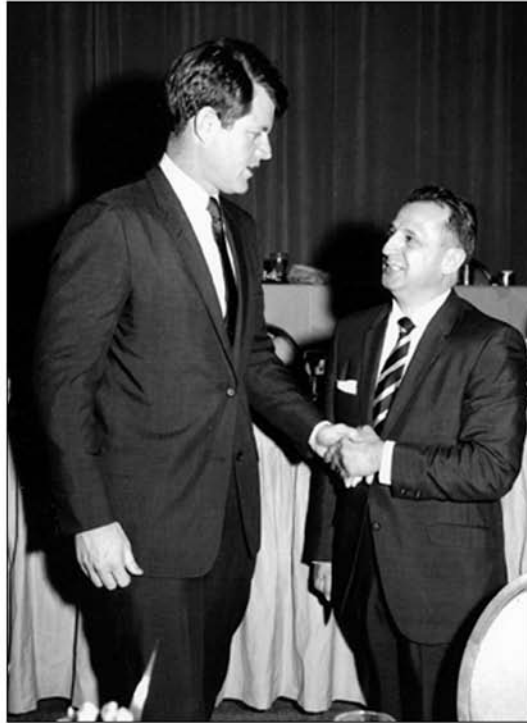
Tony greets future U.S. Senator Ted Kennedy at a campaign stop during the 1960 JFK presidential campaign.