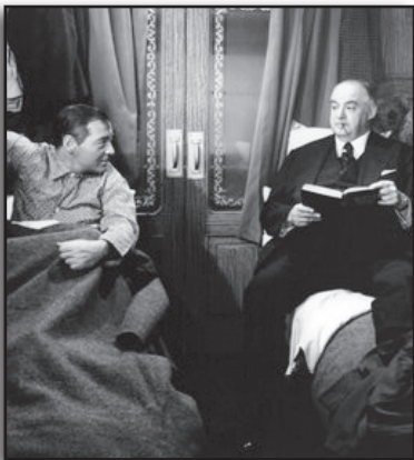
Peter Lorre with Sydney Greenstreet